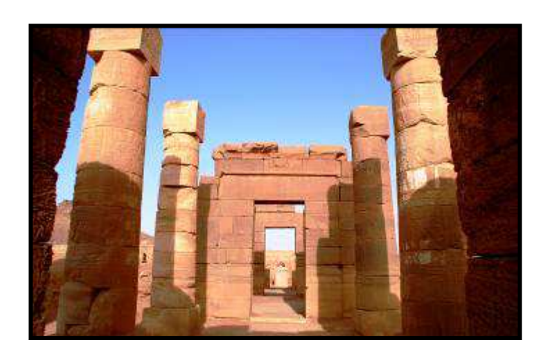
Day 1 / Khartoum - Naga and Mussawarat - Meroe

Pick up from your hotel in Khartoum in the morning and then departure northward. After passing the last stretches of Khartoum, we drive through a desert area characterized by granite rocky hills. These are the last offshoots of the 6<sup>th</sup> Cataract. After about 2h30 drives we reach the site of Naga , located about 30 km to the east of the Nile. It is one of the two centres that developed during the Meroitic period. In Naga , in a typical Saharan environment with rocks and sand, we find a temple dedicated to Apedemak (1<sup>st</sup> century a.D.): a wonderful building with bas-relief decorations depicting the god with a lion's head, the Pharaoh, noblemen and several ritual images. A few metres away there is a small and odd construction with arches and columns, named " kiosk ", in which we can notice Egyptian, Roman and Greek styles, all at the same time. Not far away we reach another temple dedicated to Amon with many statues of rams and beautiful gates decorated with bas-reliefs. We then go to