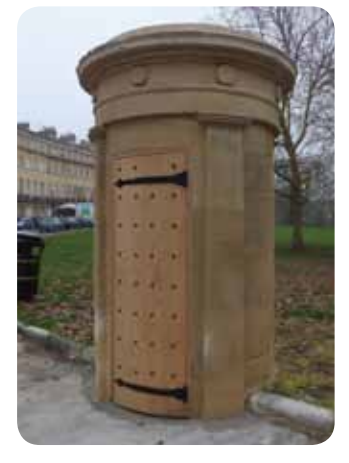
The Watchman's Box, before and after restoration