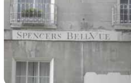
Incised street names, before and after restoration